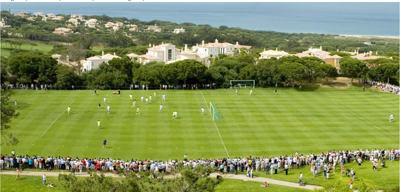
England football team pre-World Cup 2006 training camp at Vale do Lobo.