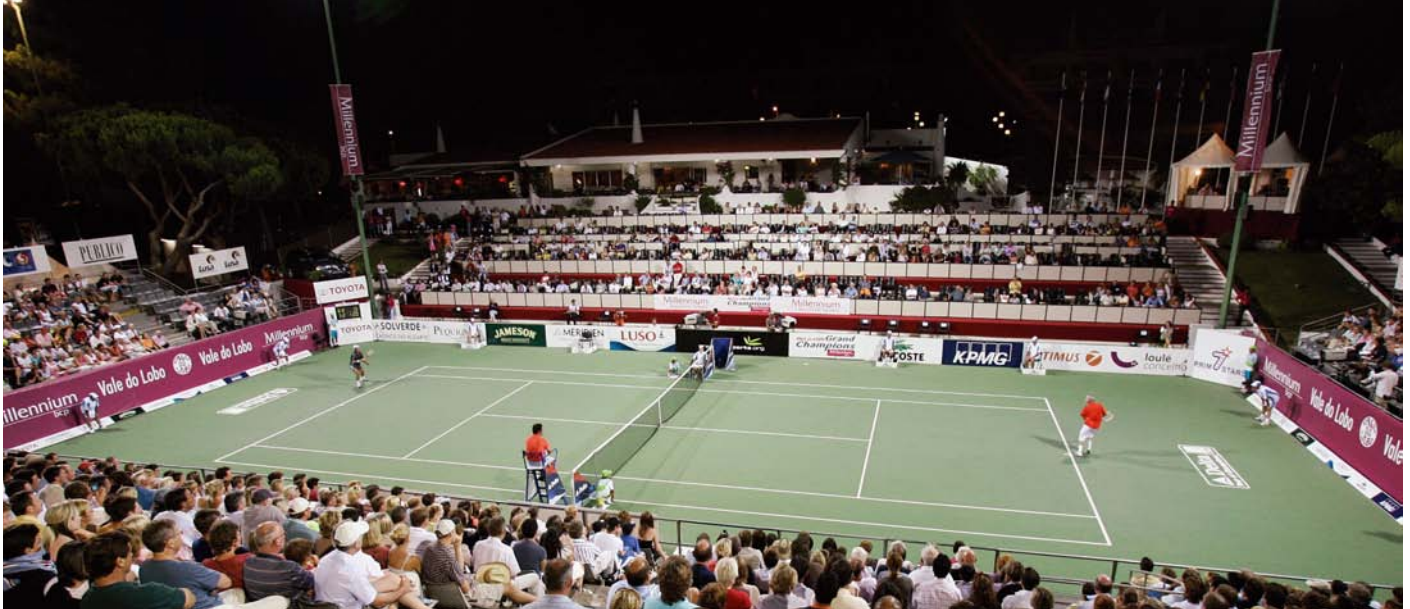
Vale do Lobo Grand Champions

The Golf Centre is located in the Parque do Golfe complex, which offers a full complement of services, including a branch of Nevada Bob's, the biggest golf store chain in Europe, and a fully-equipped gym with a physiotherapist specialised in golf injuries. Also present, of course, are club and buggy rental, changing facilities and the clubhouse restaurant and bar, whose terrace overlooks a pretty sculpture garden, making it an environment that both golfers and non-golfers can enjoy. The Golf Academy incorporates short practice areas and a putting green. Professional coaching is available from a resident teaching professional.