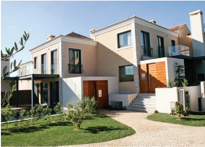
Royal Golf Development